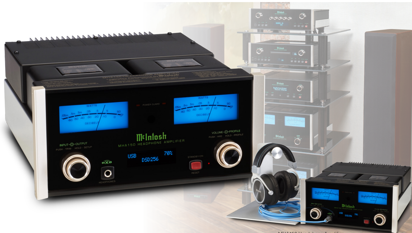
MHA150 Headphone Amplifier with MHP1000 Headphones. MHP1000 sold separately.